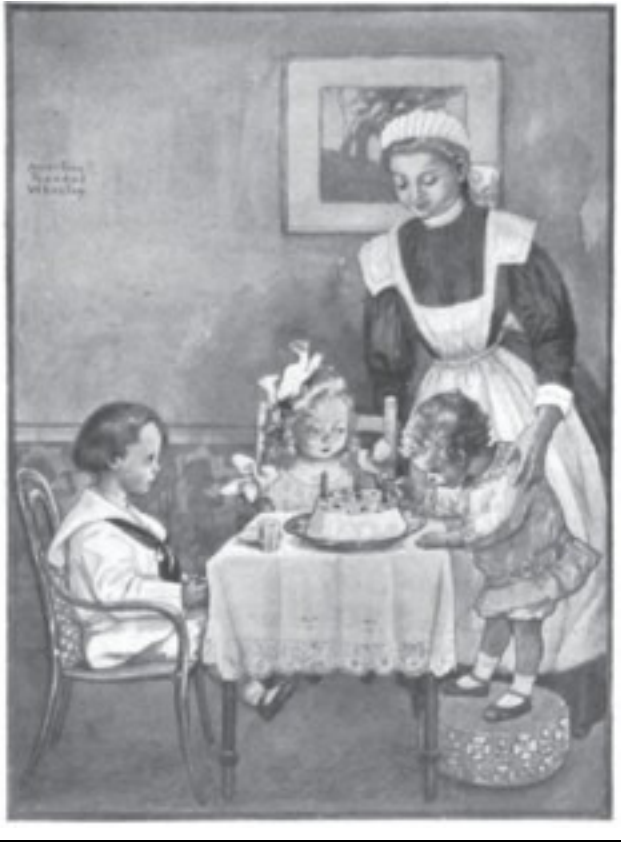
Birthday Party from St. Nicholas (1909)

She explained a large cake was to be baked in the "dripping pan and heavily frosted." When the frosting was partially