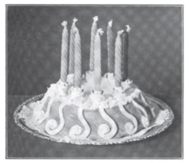
Decorated cake with piped frosting & rosebud candle holders served on a silver platter.

The sponge cake became the favored child's birthday cake. This separated it from the butter based fruit cake which also became a favored cake for use as a birthday cake presumably for adults.