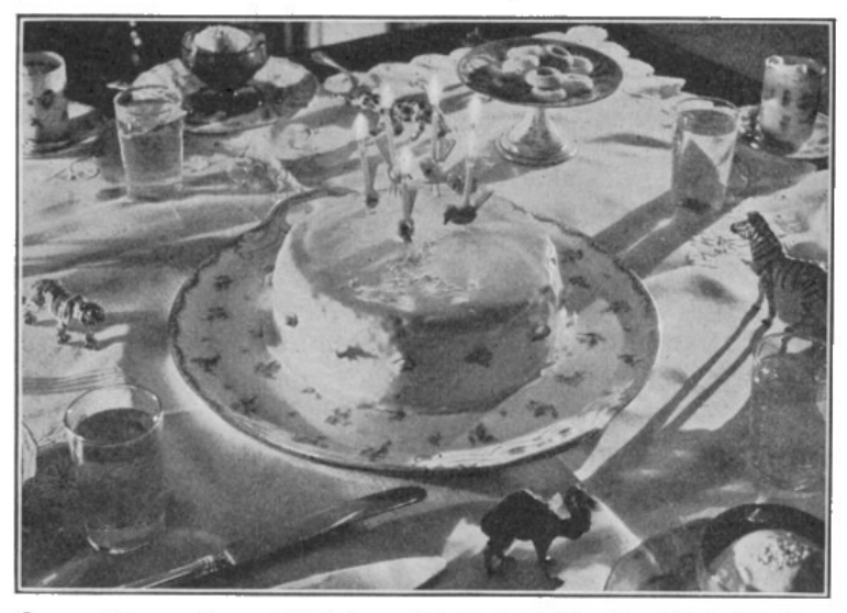
Cream Sponge for a Birthday with Bright Wooden Birds Feeding on Tiny Candy "Seeds"

no longer a candle ring it was replaced by small brightly colored wooden birds arranged like a small flock of birds feeding on seeds on the ground. It was cute for a child's birthday decoration. ( Boston Cooking School Cook Book 1936, 652)