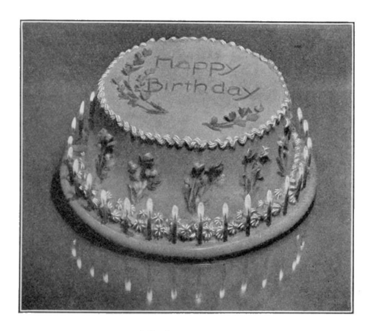
Birthday Cake An early example of the words "Happy Birthday" appearing on a cake. Boston Cooking School Cookbook 1933, p.684

The major change was the wording " Happy Birthday " written on top. Although it did not immediately take hold, this proved to be revolutionary (p.684).