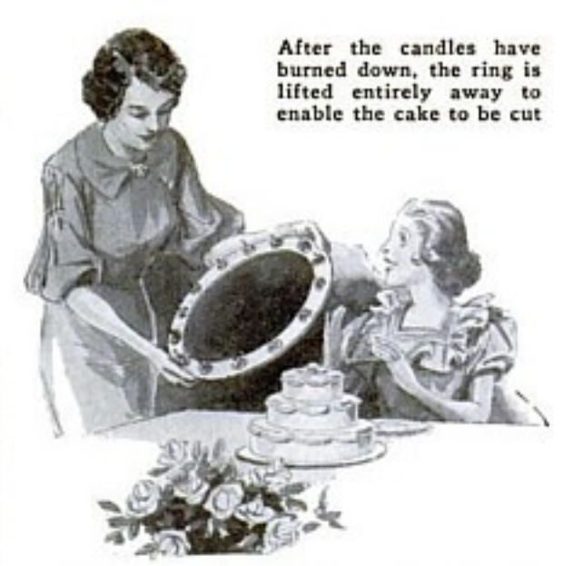
Left - Cake board with holes drilled around edge for candles Popular Mechanics (May 1915) Right - Cake ring with holes drilled around the edge for candles Popular Mechanics (May 1936)

These rings could be made as a do-it-yourself home projects. The School Arts Magazine (Oct 1914) gave the following instructions: "It consists of a circular ring of wood, about a foot in diameter and an inch wide by a little less in thickness, in sections. Holes are bored in the ring at equal intervals, to hold birthday candles. This ring is placed on a table, the birthday cake in the center." Popular Mechanics (May 1915) provided instructions for a slightly different version. "Birthday-cake boards arranged to accommodate any number of candles up to 26, are made of hard wood finished in its natural color. These boards are circular in shape, and around the outer margin is provided a series of holes in which the candles are held, while the cake itself is placed in the middle of the tray." (p.706) These candle ring holders were being used into the 1930's. Popular Mechanics (May 1936) gave instructions for a more elaborate cake board with attached ring.