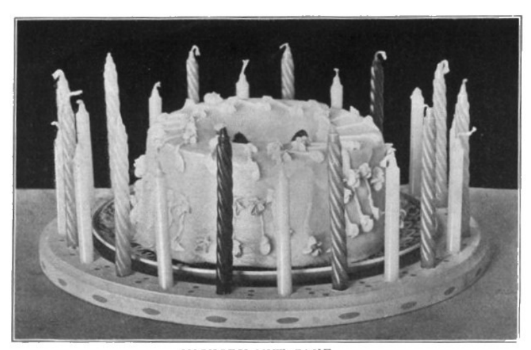
HICKORY NUT CAKE HAND PAINTED RING TO HOLD BIRTHDAY CANDLES

This version of the cake maintained the special quality but lacks the elegance of the earlier cake served on a silver platter. It brings the Birthday Cake into the realm of the middleclass family. The hand painted candleholder ring is a simple wooden ring with simple/plain painted dots and ovals. It is an inexpensive mass produced product. In reality it was an upgraded version of the 1899 homemade paste-board frame to hold the candles placed around the top edge of cake. (p.776)