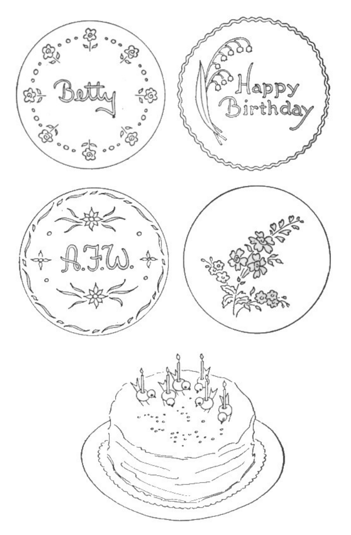
Various birthday cake decorating ideas. Boston Cooking School Cookbook 1947, p.686-87

New to this time period was the person's name or initials in ornamental frosting on top of the cake. The person's name was not used with the words "Happy Birthday" it was one or the other.